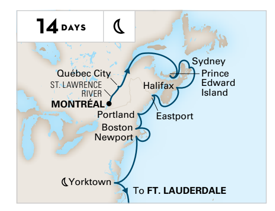
COLONIAL NEW ENGLAND & ATLANTIC SEABOARD: MONTRÉAL MONTRÉAL TO FT. LAUDERDALE Volendam Sep 28

Did you know that tiny Cap-aux-Meules is home to North America's second-largest wooden church? The wood used to build St. Pierre de La Vernière was retrieved from one of the area's many 19th-century shipwrecks and had to be blessed before being used. Hear more fascinating tales as you shop for handmade local wares, explore secluded beaches, and witness the ebb and flow of life in this far-flung corner of Québec.