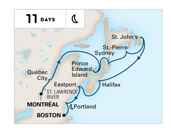
NEW ENGLAND, NEW FRANCE & NEWFOUNDLAND: ST. JOHN'S MONTRÉAL TO BOSTON Volendam Aug 27

Did you know that the 1781 "Siege of Yorktown" is widely considered the decisive battle that led to the American Continental Army's victory over the British? Admire Yorktown's lovingly preserved colonial homes and historic battlefields or transport yourself back to the 18th century in Colonial Williamsburg – the U.S.'s largest outdoor educational living museum that keeps alive the story of American independence.