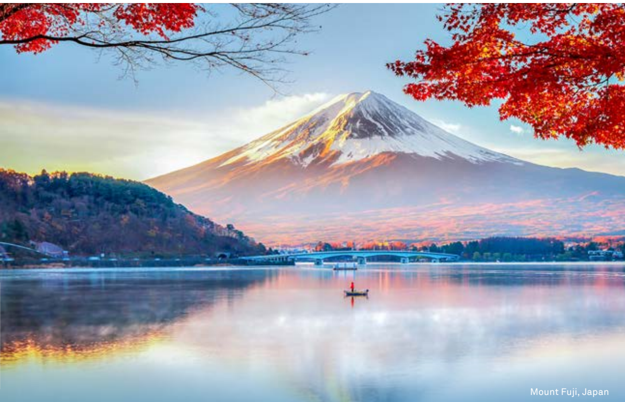
Mount Fuji, Japan