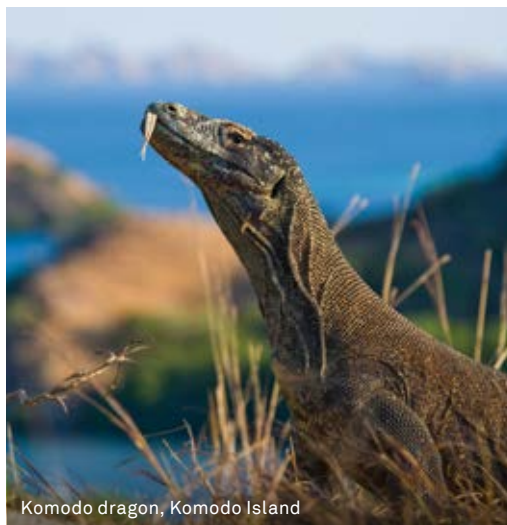
Komodo dragon, Komodo Island

16 Day - Discover Komodo & The Spice Islands