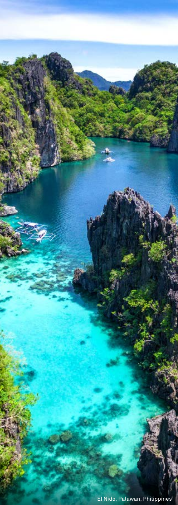
El Nido, Palawan, Philippines