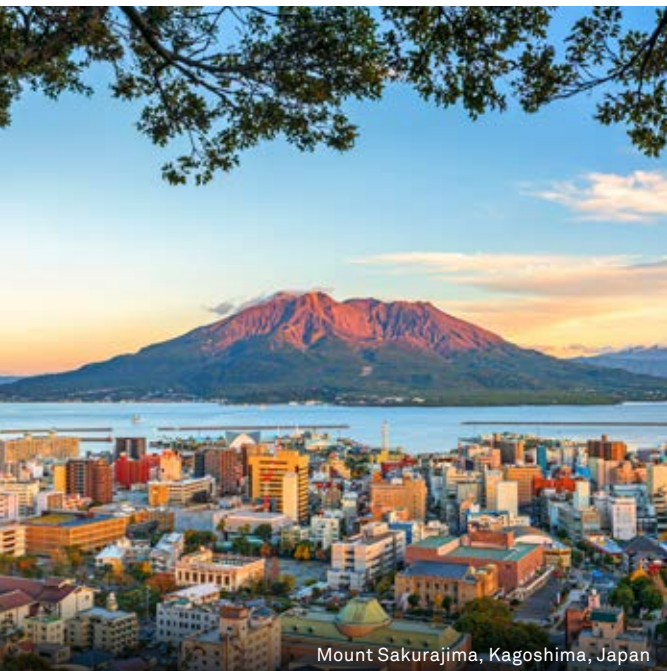
Mount Sakurajima, Kagoshima, Japan