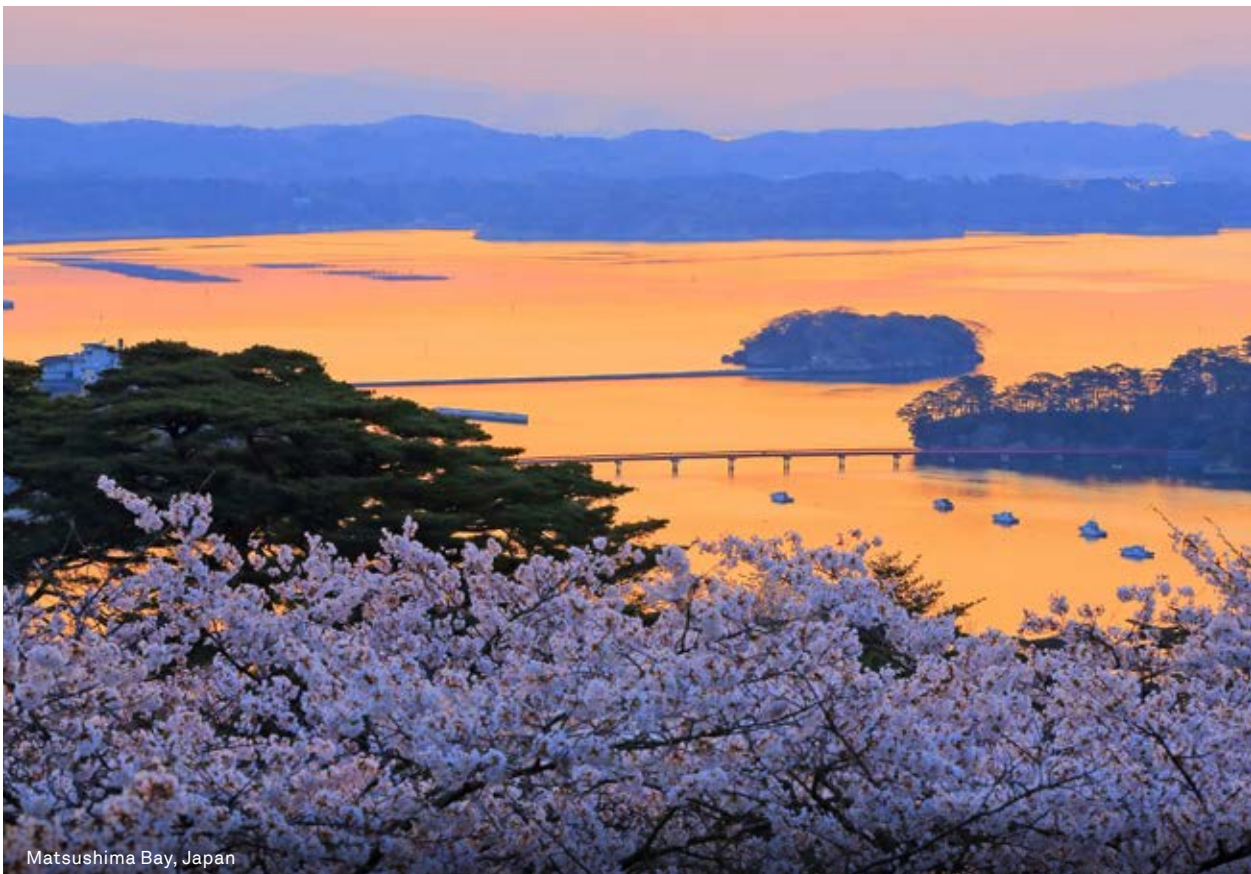
Matsushima Bay, Japan