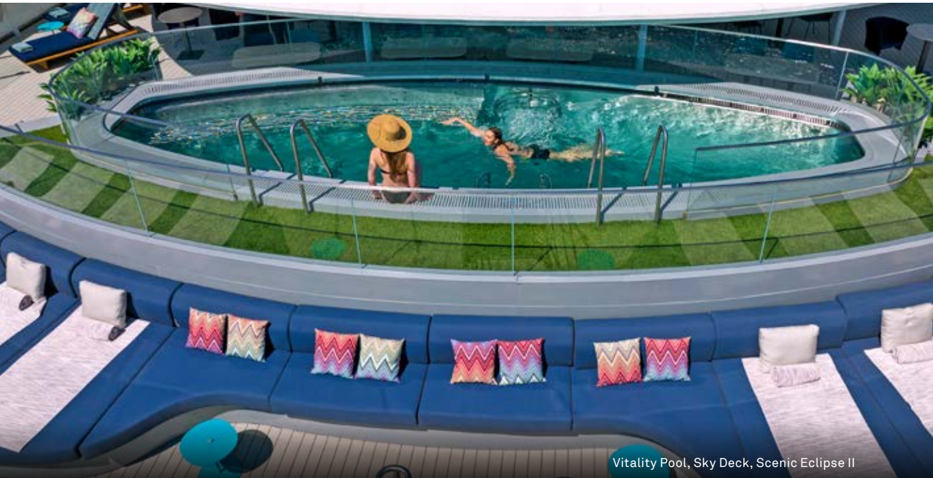
Vitality Pool, Sky Deck, Scenic Eclipse II

Discover the benefits of ultra-luxury cruising on board The World's First Discovery Yachts.