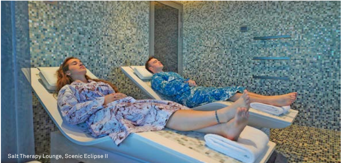
Salt Therapy Lounge, Scenic Eclipse II