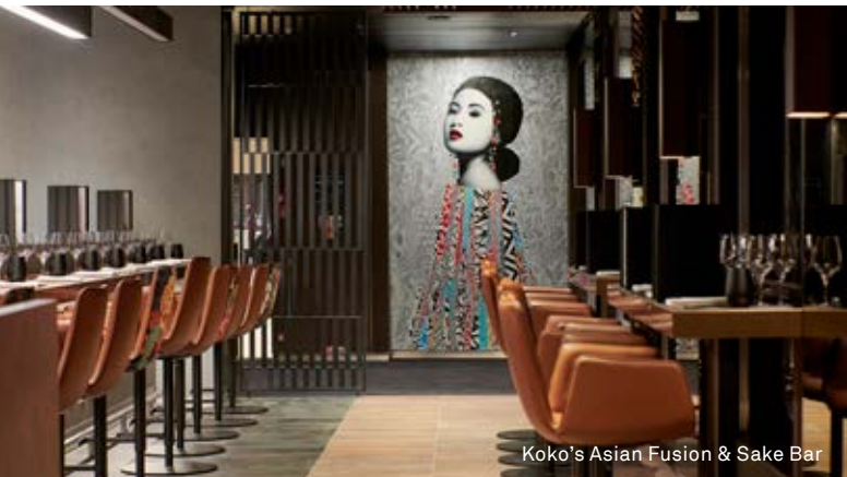
Koko's Asian Fusion & Sake Bar

*Chef's Table is by invitation only based on guest suite category and Scenic Club loyalty tier, for more information visit scenic.ca/scenic-club