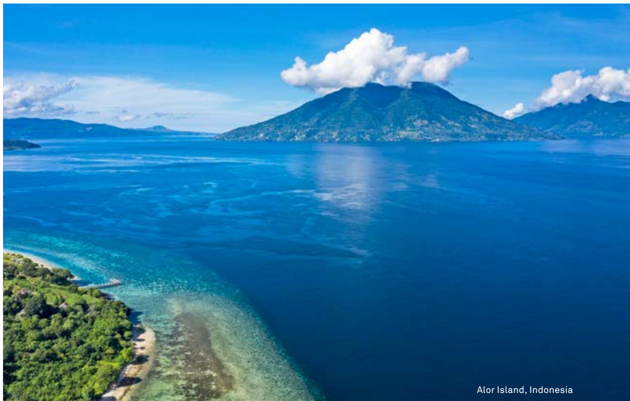
Alor Island, Indonesia