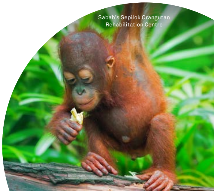
Sabah's Sepilok Orangutan Rehabilitation Centre

17 Day - Natural Treasures of Indonesia, Borneo & Taiwan