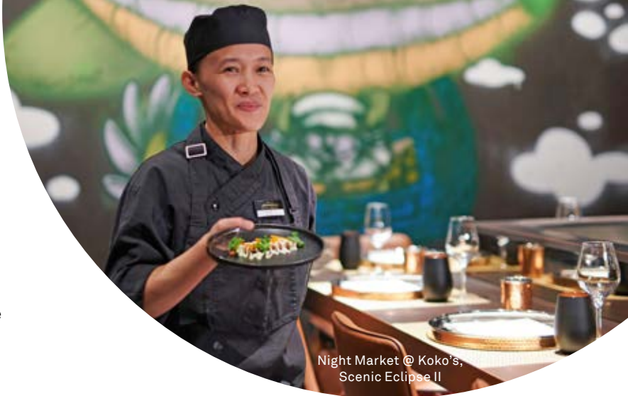
Night Market @ Koko's, Scenic Eclipse II

It's much more than great food. It goes all the way to how the dishes can connect to tell a story, and the amazing spaces we have. At Koko's, we encourage guests to try new things. It's a vibrant, colourful atmosphere. Then, I created the Night Market because I believe street food should be honoured, and I want to elevate it and make it more desirable.