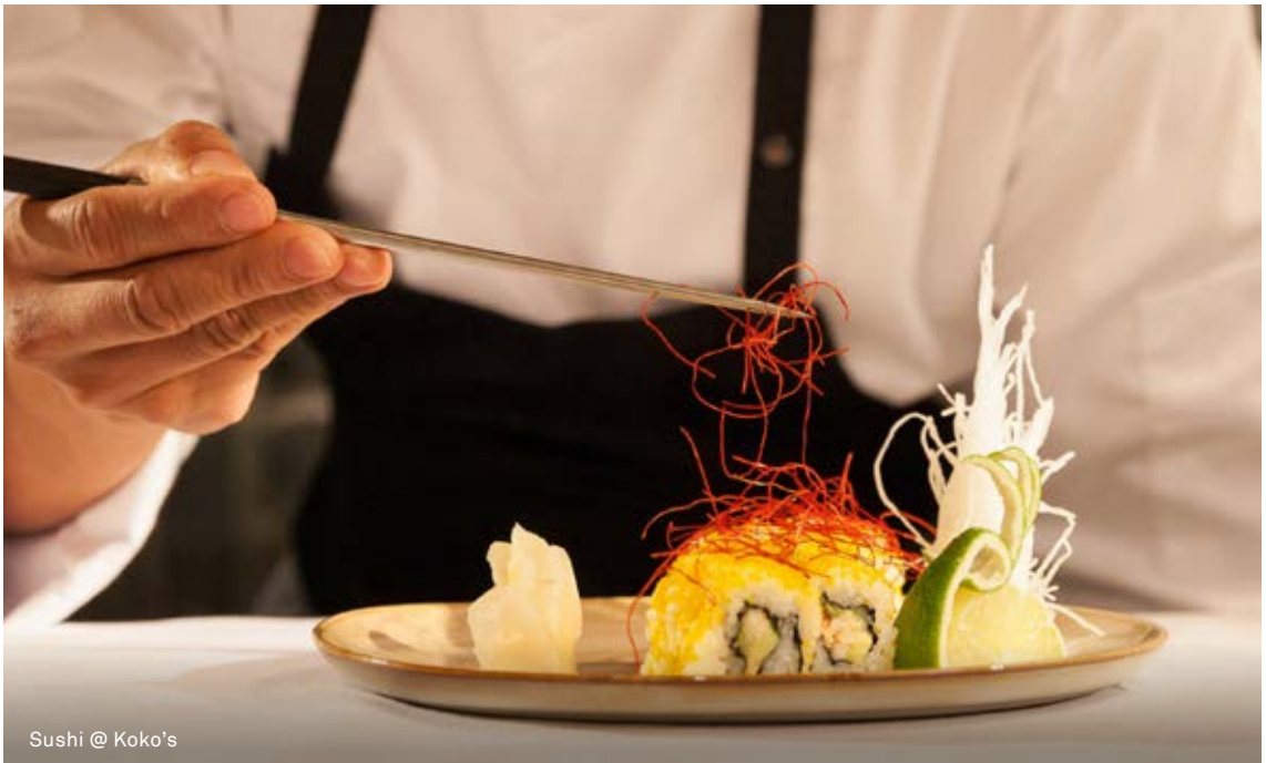
Sushi @ Koko's

Enjoy this traditional Japanese drink with a modern twist. With 14 premium varieties on board, experiment with cocktails, take it cold before dinner or hot to neutralise your palate as you finish a meal.