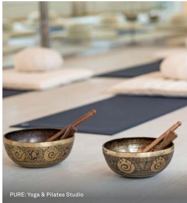
PURE: Yoga & Pilates Studio

Experience a sense of tranquility from the moment you arrive at the stunning gold leaf reception, at the expansive 5,920ft 2 Senses Spa*. The Ginkgo leaf is the symbol of this luxurious retreat, reflecting the beauty, strength and vitality of the Ginkgo tree revered throughout Eastern cultures.