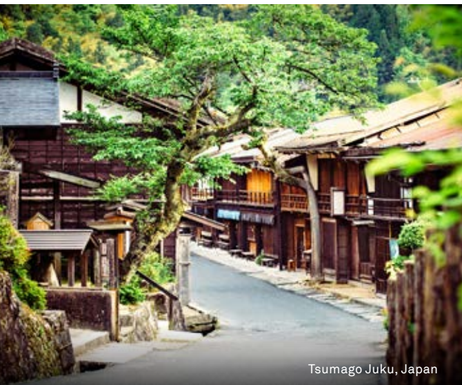
Tsumago Juku, Japan