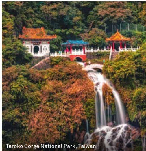
Taroko Gorge National Park, Taiwan