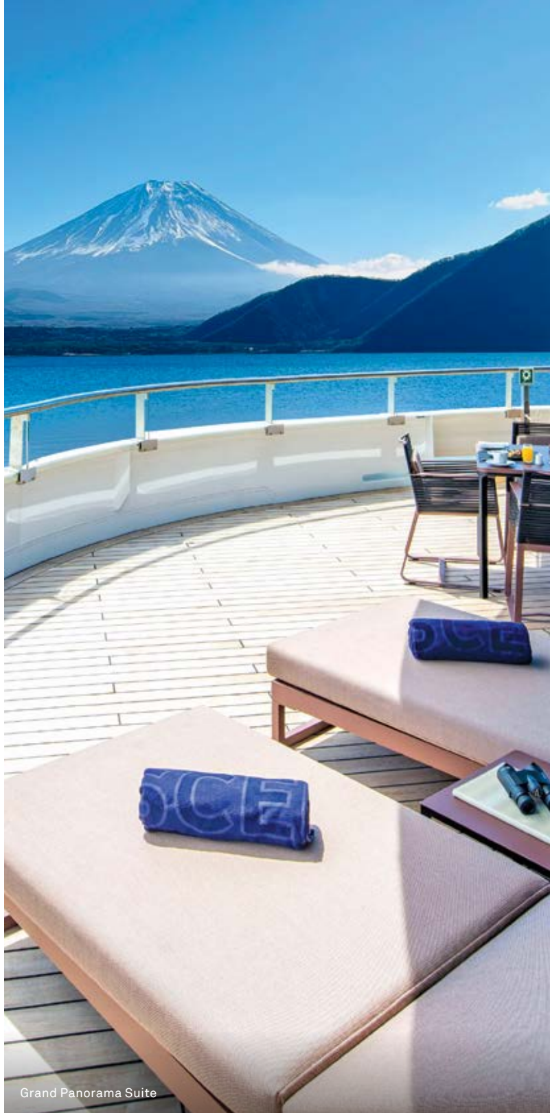
Grand Panorama Suite

In addition to the standard inclusions, our Spa, Panorama, and Owner's Penthouse Suites feature steam showers, complimentary laundry service and luxurious baths. The Panorama and Owner's Penthouse Suites include VIP embarkation and disembarkation access to private dining and more.