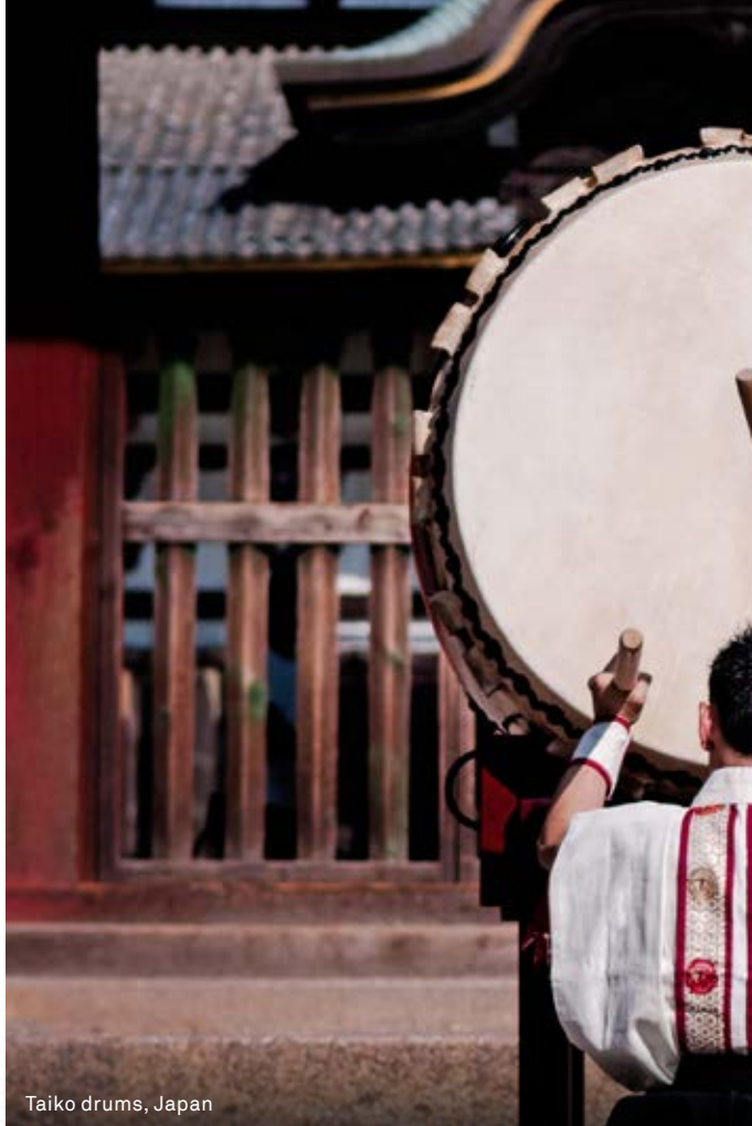
Taiko drums, Japan